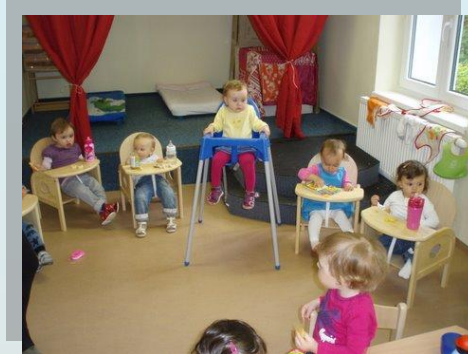
Birthdays this summer...

The Tree Frogs are looking forward to summer as we spend more and more time outside in the beautiful sunny weather. It will be a sad month for me as I part from the children. I hope to have a great last month filled with games, laughs, and smiles! We'll be continuing with some IPC themes this summer along with the Cheeky Monkeys with topics like The Olympics and The Environment.